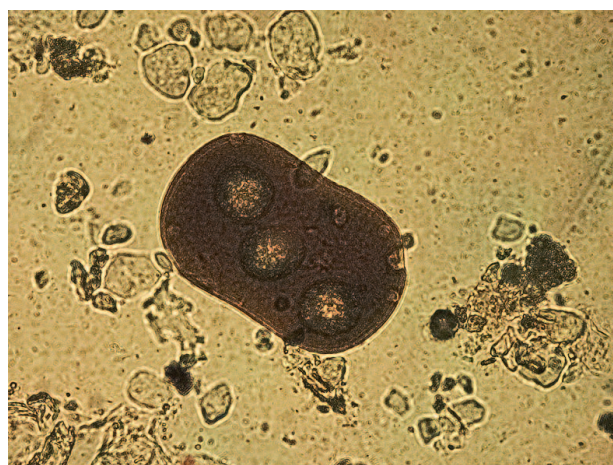
Fig. 2. Packet of eggs of Dipylidium caninum . Magnification 200\times .

examination of proglottids showed characteristic brown packets with D. caninum eggs. There were a dozen or more packets in each proglottid containing from one to a few, mostly 3–4 eggs. In direct preparations in 0.9% sodium chloride and in Lugol’s solution, single packets with D. caninum eggs were found. The decantation technique, revealed many D. caninum egg packets (Fig. 2). The eggs contained round oncospheres with thick embryonic membranes around them. Preparations