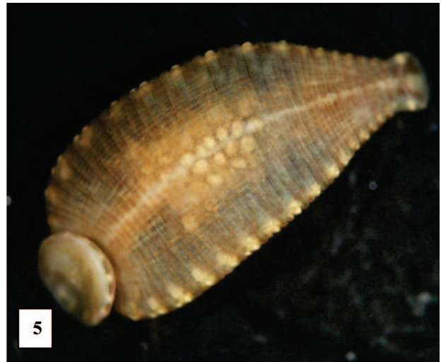
Fig. 5. Parasite in body Hemiclepsis marginata (ventral view)