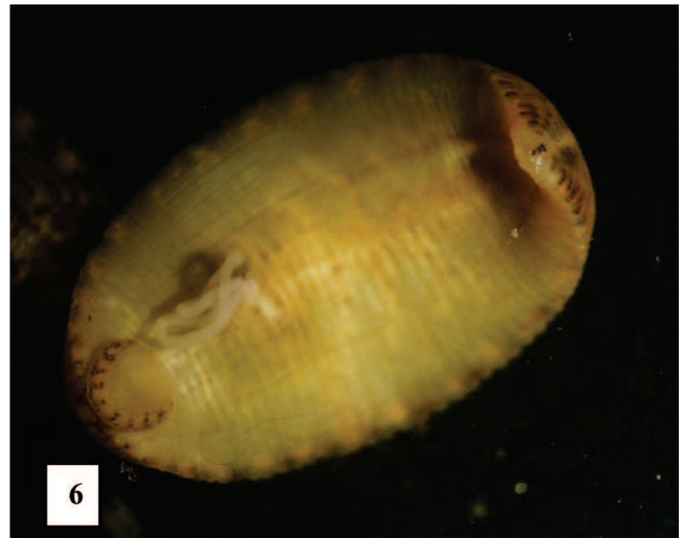
Fig. 6. Nematode on body Glossiphonia sp. (ventral view)

Trocheta bykowskii (Gedroyć, 1913) are listed on the Red List IUCN of Endangered Species in Poland [26]. One species, Hirudo medicinalis is strictly protected in Poland and delineated under appendix II of the Convention on International Trade in Endangered Species (CITES).