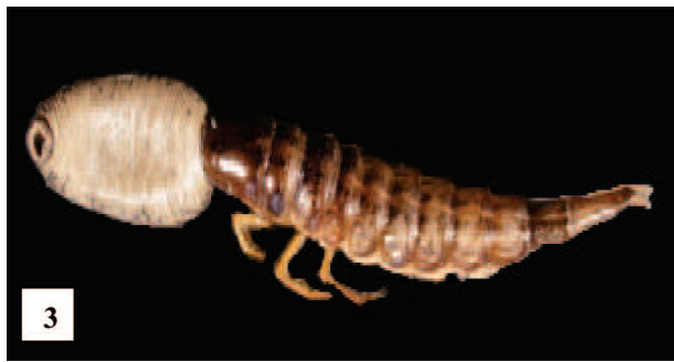
Fig. 3. Haemopsis sanguisuga attacking larval form of the Dytiscus marginalis (gift from Prof. E. Biesiadko)