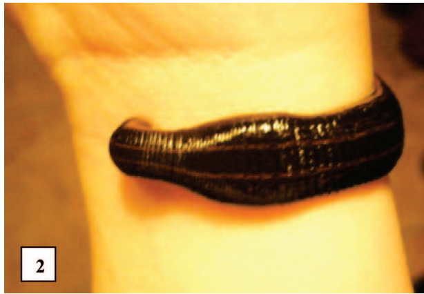
Fig. 2. Hirudo medicinalis sucking blood