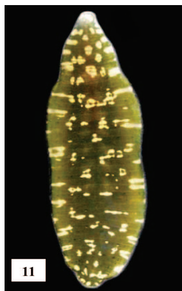
Fig. 11. Theromyzon maculosum Trocheta subviridis Dutrochet, 1817,