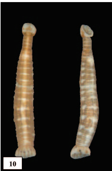
Fig. 10. Italoabdella ciosi

et al. [73,74 in press) suggest to treat E. octoculata as one valid species with large morphological variability. Recently, very interesting data