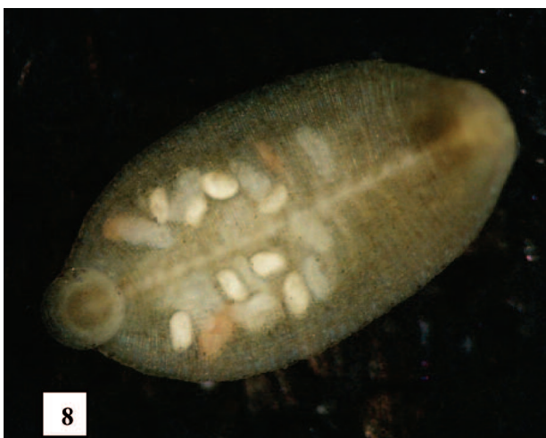
Fig. 7-8. Parasites in body Albglossiphonia papillosa (7. ventral view, 8. dorsal view)

et al. [73,74 in press) suggest to treat E. octoculata as one valid species with large morphological variability. Recently, very interesting data