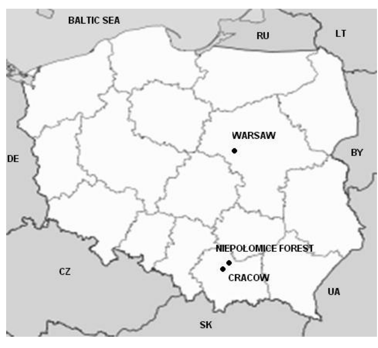
Fig.1. Localization of the Niepolomice Forest in Poland

The area of studies and tick collection. Ticks were collected in the spring on 31 March 2011 in Niepołomice Forest (DA44 UTM), (Małopolska province, southern Poland) (Fig. 1). It is a large forest complex situated in the western part of the Sandomierz Valley, adjacent to Cracow, one of the largest cities in Poland. The total area of