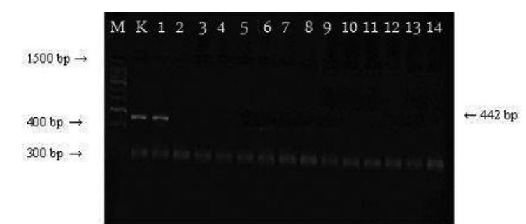
Fig. 4. The amplification products of flagelline gene fragment for Borrelia burgdorferi s. l., size of 442 base pairs [bp]. Explanations: M – molecular weight standard (Promega, USA); K - B. burgdorferi s. l. positive control; 1 – positive sample; 2–14 – negative samples.

Fig. 3. The products of amplification of 16S rDNA gene fragment for Anaplasma phagocytophilum , the size of positive samples was 227 base pairs [bp]. Explanations: M - marker (Blirt S.A., Poland); K - A. phagocytophilum positive control (Blirt S.A., Poland); 1,2,3,6,7 – positive samples; 4,5,8 – negative samples.