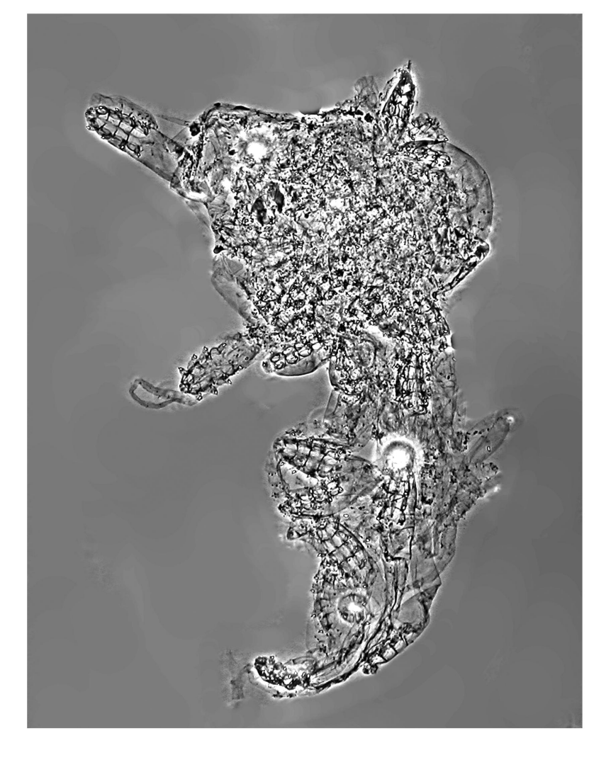
Fig. 2. Group of specimens of Demodex flagellurus prepared from host tissues

belonged to different local populations.