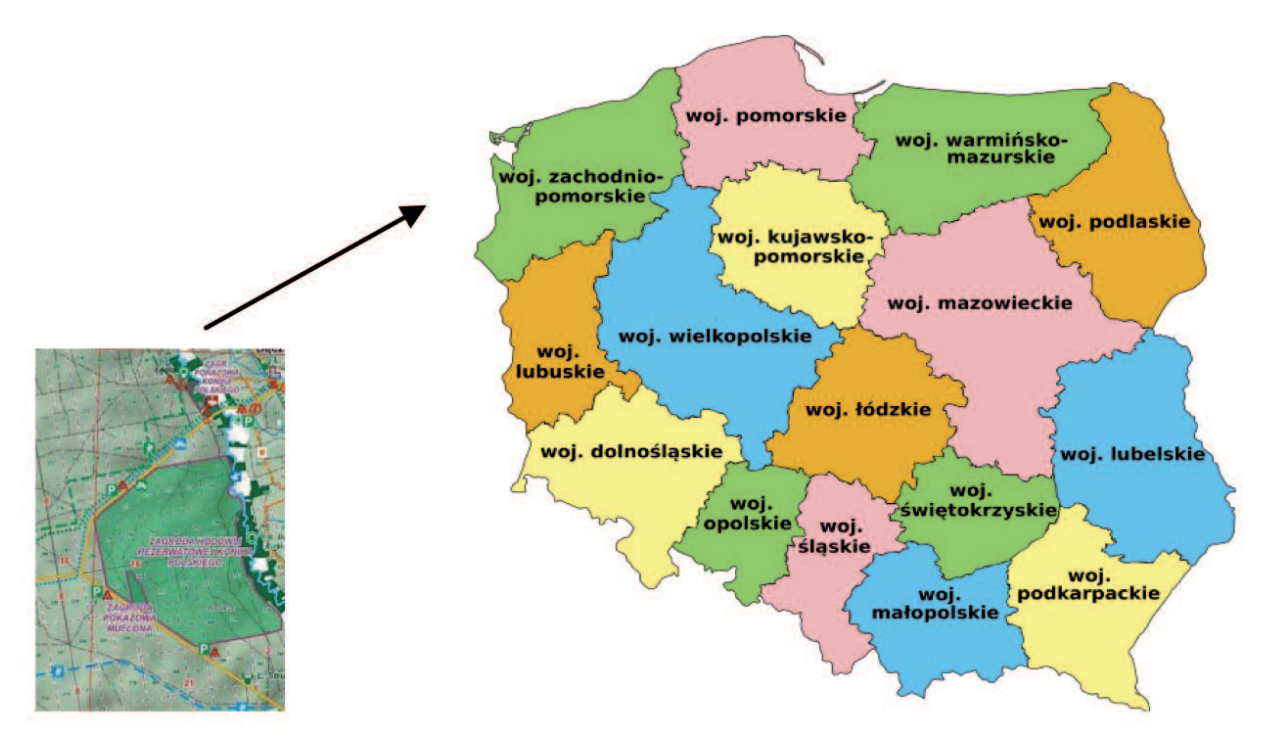
Fig. 1. The map of Goleniowska Forest, Poland

Goleniowska Forest; its second aim was to assess the effectiveness of deworming.