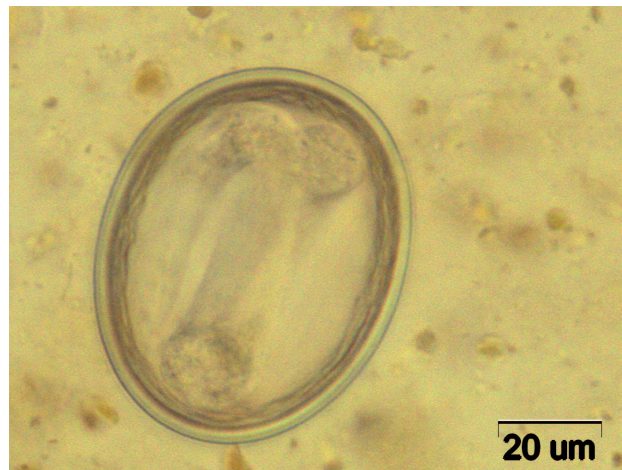
Fig. 2. Egg of Toxascaris leonina

gram of faeces. Single egg of Ancylostoma sp. was also found.