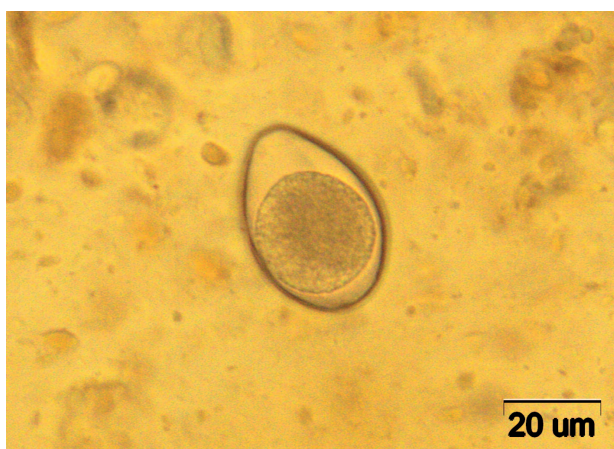
Fig. 4. Oocyst of Cystoisospora felis