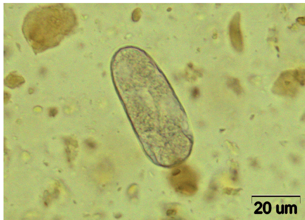
Fig. 3. Egg of Ancylostoma sp.

Faeces of two lynx kept together contained approximately 31 and 2 eggs of Toxocara cati (Fig. 1), 210 and 11 eggs of Toxascaris leonina (Fig. 2), 6 and 14 eggs belonging to the genus Ancylostoma (Fig. 3). Third lynx, maintained in another enclosure, was infected with Cystoisospora felis (Fig. 4,5) with intensity reaching 4 oocysts in 3