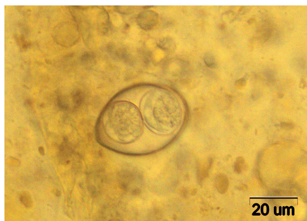
Fig. 5. Oocyst of Cystoisospora felis during sporulation

The most intensive was infection with T. leonina . Analysis of faeces revealed the presence of T. leonina in two samples from lynx kept together. It is considered to be typical parasite of both feline and canine species [11]. Analysis of faecal samples from wild and domestic carnivorous mammals in Białowieża Forest revealed that 12.5% of dogs and 25% of cats were infected [7]. Despite the fact that it is known to attack also wild animals, T. leonina seems to be rare in Eurasian lynx and in natural conditions infects only individuals. So far, it has been registered only in a single lynx from Switzerland [2]. However, according to Okulewicz et al. [12] T. leonina infections are especially common and prevalent in large felines from zoological gardens – 57.1% of Felidae, including lynx, from Zoological Garden of Wrocław were infected with this nematode. There are also some data about finding T. leonina in snow-leopards from zoological garden in Plock and Warsaw [13]. It is