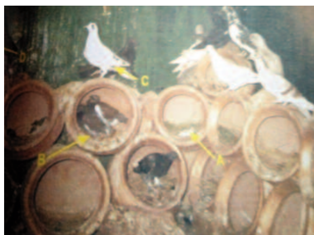
Fig. 2. Pigeons in their natural environment (loft) from Municipal Local Government Area of Kano State A – squabs; B – squakers; C – youngsters

practices of rearing pigeons in parts of Nigeria, which expose the birds to substantial numbers of oocysts [13]. However, no clinical signs were observed as only the sub-clinical form occurred most frequently. After first ingesting some quantities of oocysts, the pigeons develop immunity to infection by the stimulation of endogenous defence mechanisms, without visibly succumbing to the disease. With this protection, immunity is reinforced by constant ingestion of low levels of oocysts; the birds live in a kind of equilibrium with the parasites, which also protects them against severe intestinal disease [21]. While squabs suffer the greatest losses to the clinical form of the disease, characterised by diarrhoea and sudden death, mortality may occur in birds as old as three to four months [22], and may occasionally be seen where birds are reared intensively and under poor hygiene conditions. Older birds only serve as carriers and remain apparently healthy [11]. Higher infection rates were reported in Hyderabad, India, 32.7% (121/370) [5], South Khorasan, Iran, (40.19%) [23] and Changhai, China, (55.2%) [10]. In addition, infection has been observed in 89–93% of squabs and squeakers and