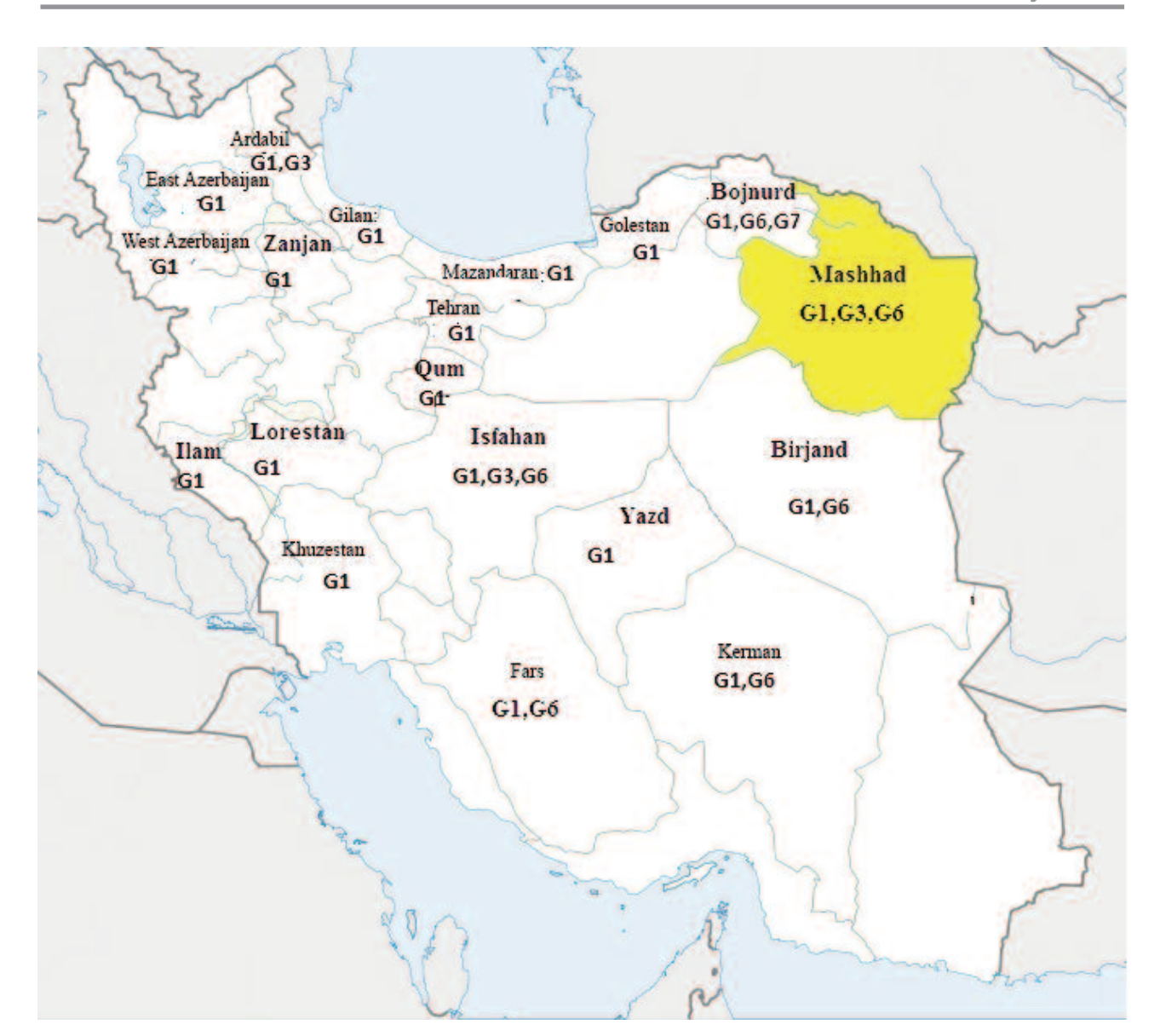
Fig.1. Geographical distribution of CE strains in different regions of Iran with showing investigated area in this study

these genotypes should be united in the species E. canadensis . Due to the morphological differences between the G8 and G10 genotypes, it seems appropriate to formalize the name E. canadensis (G10) and E. borealis (G8) formally in association with their morphological descriptions [9].