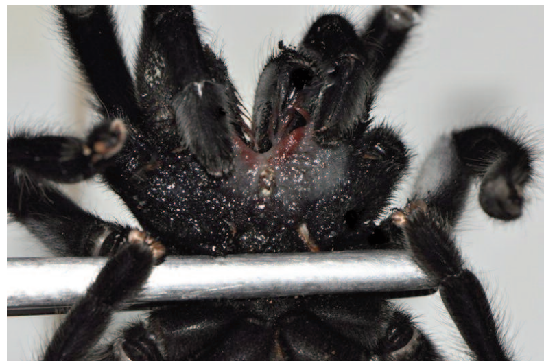
Fig. 1. Discharge around the chelicerae of the theraphosid spider

Spiders of the Theraphosidae family (Arthropoda: Araneae), known as tarantulas are one of the most common terrarium invertebrates [1]. Different factors that make those spiders so widespread can be listed, e.g. a high tolerance for breeders mistakes or usually problem-free reproduction. Nevertheless, spiders breeding is not always a long-lasting period. The most frequent reasons of its fatal descent are: dehydration, injury, mould or problems with moulting. Regrettably, many invasions of exotic spiders have been recorded over the years. Some of them were pure parasitic infections or enhanced with an additional bacterial invasion. However, the parasite species identification was difficult and therefore predominantly ambiguous. Recently, parasitic invasions of exotic invertebrates have