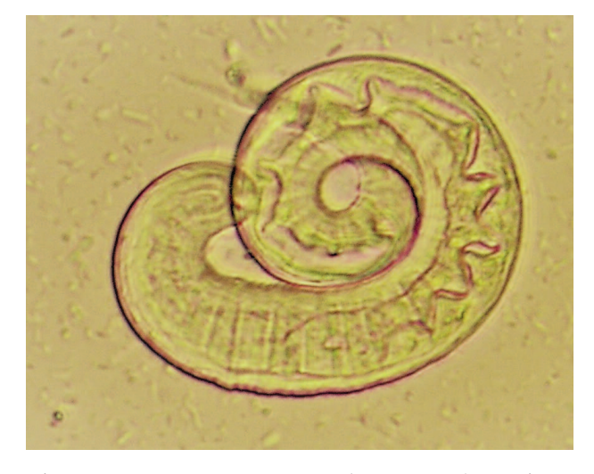
Fig. 4. Strongyloides stercoralis ; larva (Harada-Mori stool culture)

Skin rash is one of the symptoms suggesting parasitic infections. Allergic manifestations in the clinical course of strongyloidosis and schistosomatosis have been described [8]. It is connected to parasites circulation within the host organism as well as host immunological response [9,10]. These