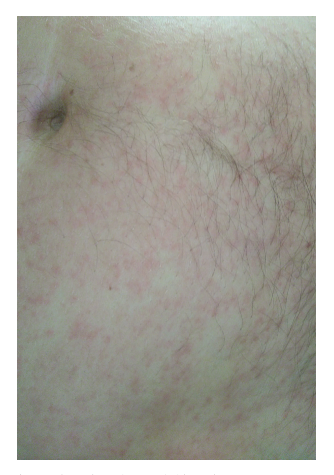
Fig. 1. Disseminated spotted skin rash

larvae, cysts. This gold standard can only be achieved only by repeated examinations [6].