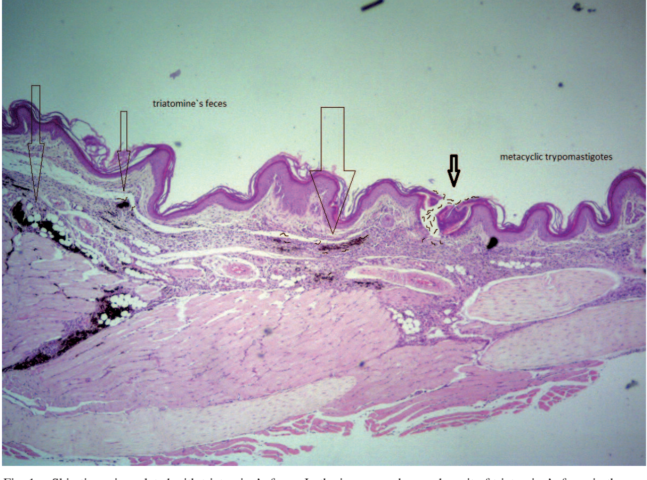
Fig. 1 a. Skin tissue inoculated with triatomine's feces. In the image can be see deposit of triatomine's feces in the dermis and the parasites drawn represents the entry of metacyclic trypomastigotes. Feces induce a strong induction of TNF- \alpha , CXCL2 and CXCL3 at the inoculation site with recruitment of neutrophils and monocytes. This inflammatory reaction induces edema-favoring escape of metacyclic trypomastigotes via linfa or blood vessels, but in the other side, some parasites can be destroyed.

Studies about the early events of this primary contact, between metacyclic trypomastigotes and skin tissue cells at the inoculation site are very scarce. One explanation is because the generation of metacyclic trypomastigotes for experimental studies require infected triatomines. MT is different in many aspects of other parasite phases such as TCT, epimastigotes or metacyclic trypomastigotes derived from culture. For example, the gp82 metacyclic stage-specific surface protein on MT has