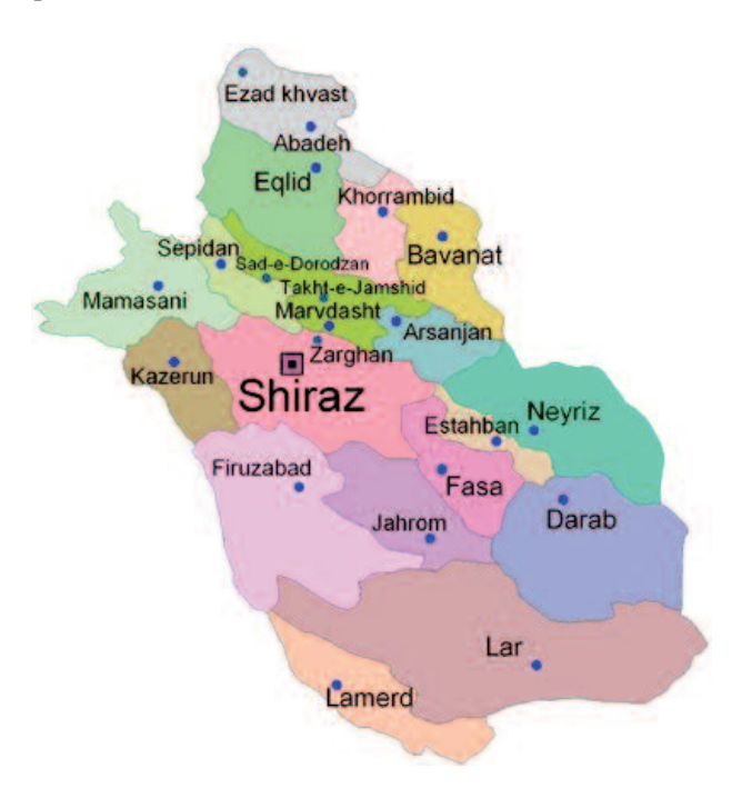
Figure 1B. Counties and central cities in Fars province, southern Iran, from where the cat's serum samples were collected

numbers of serum samples in dogs and cats [19,20]. In Iran, the northern Ardabil and the southern Fars province have the highest endemicity levels for CanL [9]. Considering the fact that there is a large number of stray cats in or around the cities and villages, it seems necessary to determine the epidemiology of FeL and its role in transmission of VL disease to human population in each endemic areas of the country.