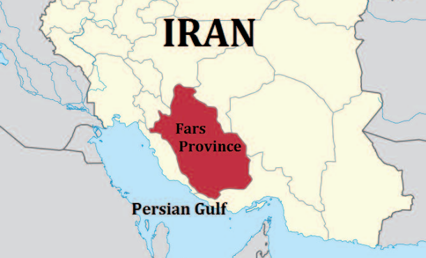
Figure 1A. Map of Iran showing the location of Fars province