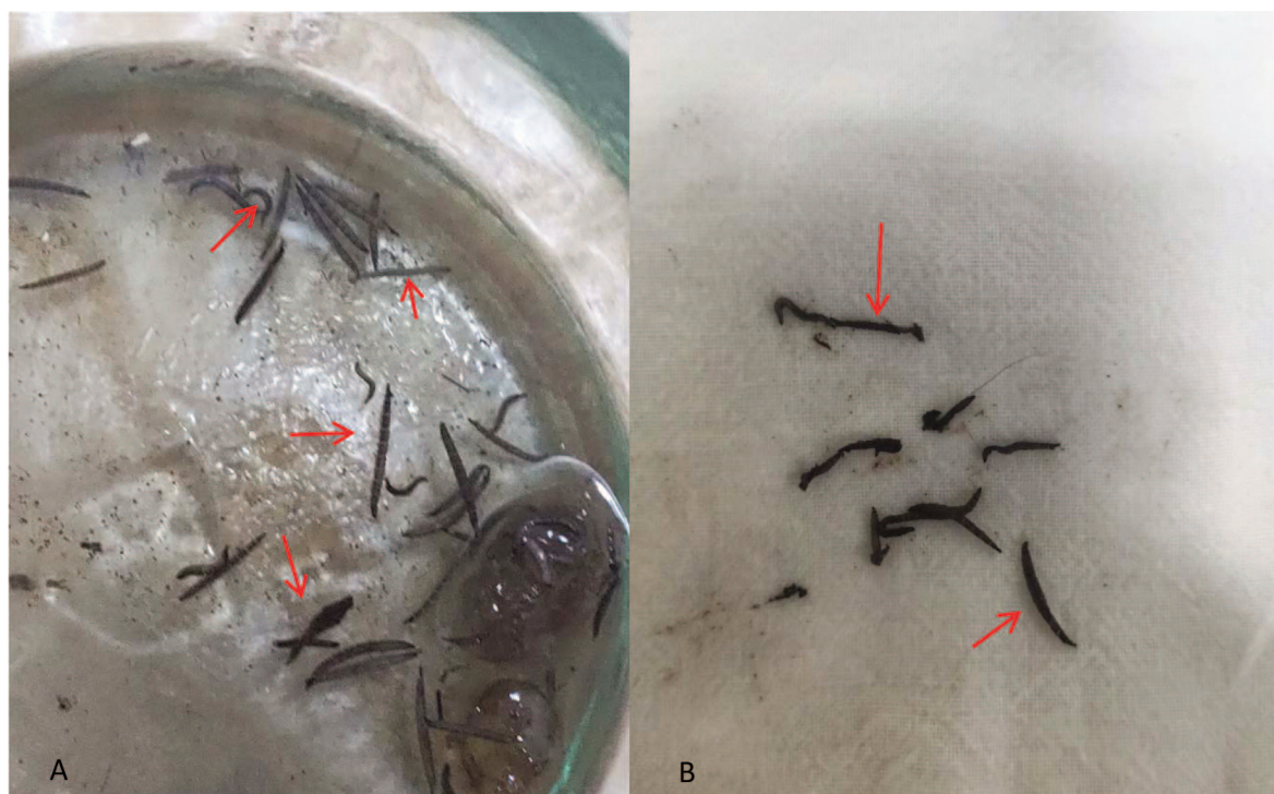
Figure 4. Progeny of the experimental group A and B: red arrows indicate dead leeches of the experimental group

otherwise (if they are left in water), their death is possible. It should also be noted that in some leeches, slightly differentiated clitella disappeared, and leeches without them did not show mortality. In our previous studies and in the observations of other authors, leeches can manifest cannibalism [20,21], which may even lead to the death of a leeches, but in current study there were no signs of cannibalism which could be a death factor. Also, it should be noted that density and water factors did not affect animal mortality. First, the water was changed every day in the experimental and control groups, which makes its toxicity impossible. Secondly, there were four animals in the tank, which makes it impossible to influence the density factor. All indicators of the experimental group were compared with the control, which discards these two negative factors. Also, the peat-soil environment for placing leeches for laying cocoons was the same, which excludes the negative influence of the environment itself. All indicators of the experimental group were compared with the control. Further research will allow us to deepen understanding of the pathogenesis of individuals' death with pronounced clitella ready for laying cocoons.