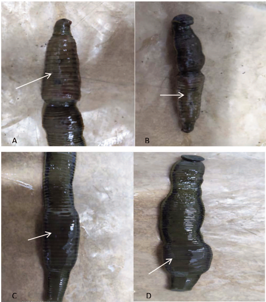
Figure 1. Dead leeches with clitella. White arrows indicate clitella: A,B,C,D.

For the study, four experimental animals groups were formed: 1 control – medicinal leeches ( Hirudo verbana ), which were allowed to breed immediately after the appearance of clitella; 2 experimental – medicinal leeches ( H. verbana ), which were kept in an aqueous medium after the appearance of clitella