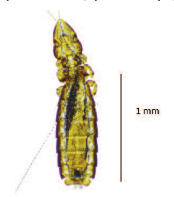
Figure 2. Brueelia blagovescenskyi, female (original)