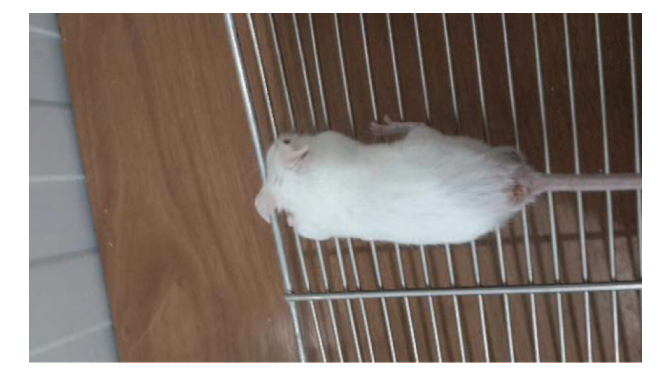
Figure 5. Mice treated with honey (400 \mu g/ml) after 60 days