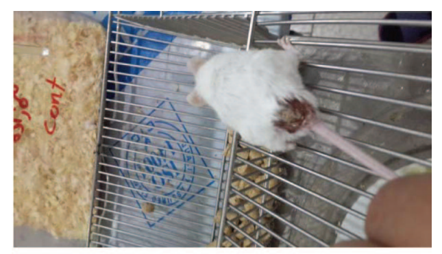
Figure 3. Untreated mice after 60 days

while in untreated control group, wounds were purulent and fetal to 4 out of 5 mice. There was a significant difference between wound diameter in