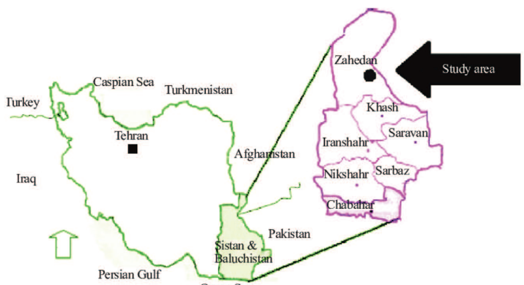
Figure 1. Area of study, Zahedan city, located in Sistan and Baluchestan province, Iran