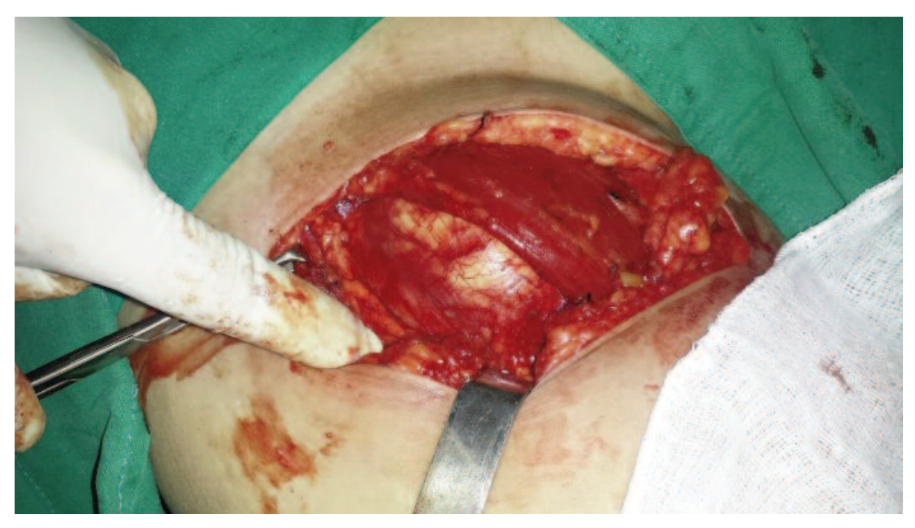
Figure 1a. Cyst is visualized below the sartorius and vast medial muscles