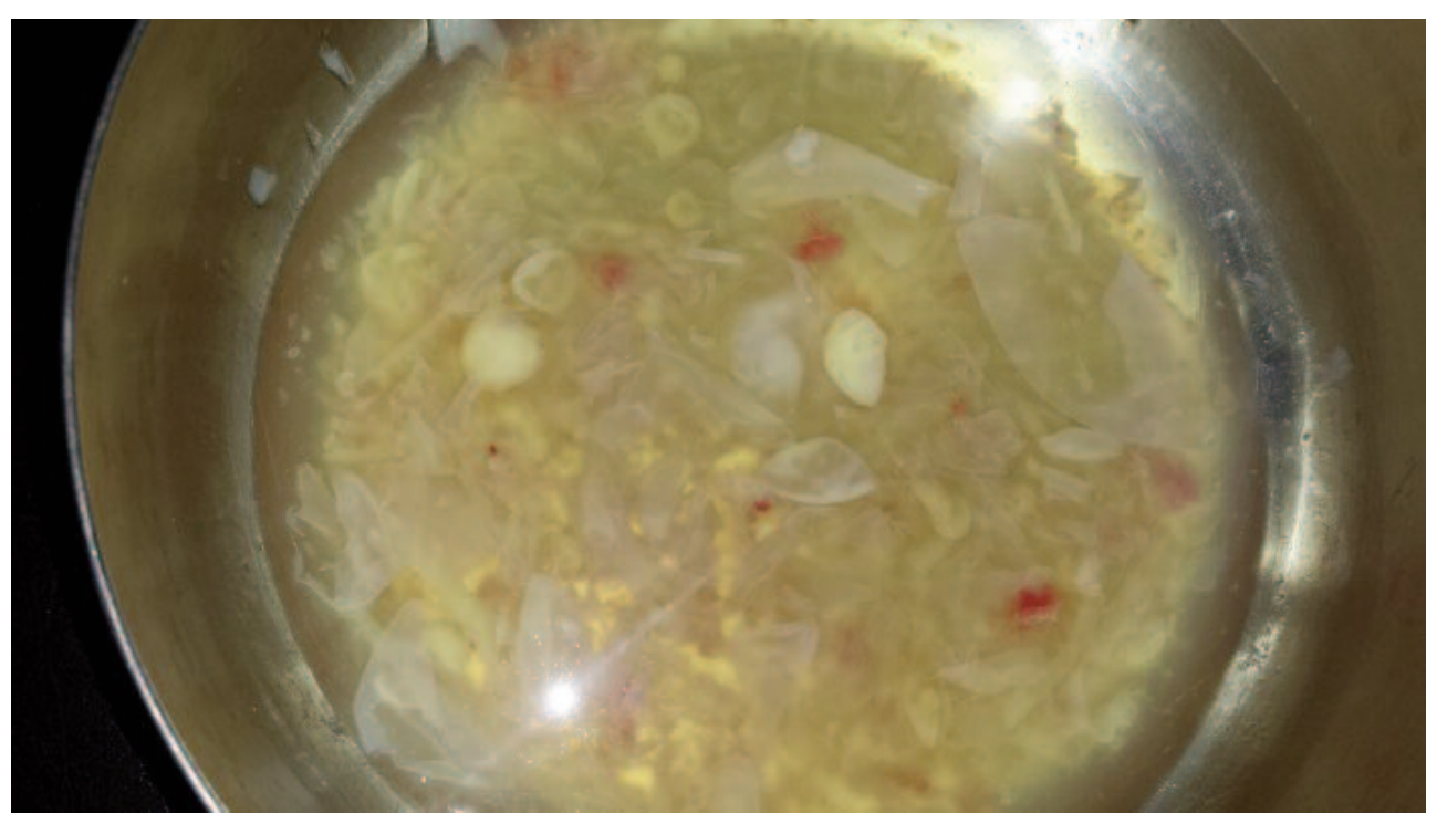
Figure 2b. Cystic content: abundant daughter vesicles plus liquid "rock crystal"

muscular hydatidosis in lower limbs. A patient reported by Botello [8] with a history of 4 years, also has symptoms of pain, functional limitation when walking and volume increase in lateral region of left thigh that ended in the cutaneous fistula. Another patient reported by Petit [9] with a one-year history, presented a mass in the lateral region of the